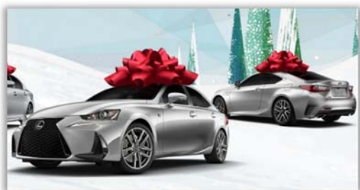
2020 Lexus Merry Christmas!

Or like how many of you, honest, anticipating Christmas—you're anticipating these moments that you have in your head of what should happen but what happens usually is what? It doesn't really meet our expectations. Like, how many of you anticipate Christmas morning and that all of your children won't fight with each other? I certainly anticipate that only to be reminded that that is nonsense, [Laughter] but I want these feelings. Right? There's this kind of feelings a part of this season and you want those