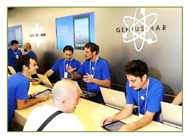
Mac Genius Bar

and they retain it and they know how to work with that knowledge and it's just their gift, and they're the people who have this spiritual ability to communicate on just about any topic in a powerful and knowledgeable way. You need those people around you. I was actually at a church last weekend and someone was using their gift along this line in the lobby, it was awesome. They had a table there and I forget what the name on it was