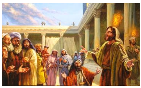
Day of Pentecost

<sup>3</sup> And divided tongues as of fire appeared to them and rested on each one of them. <sup>4</sup> And they were all filled with the Holy Spirit and began to speak in other tongues as the Spirit gave them utterance.