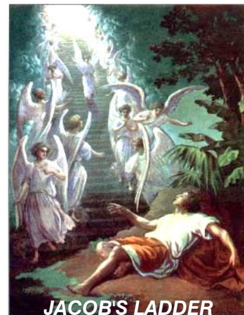
JACOB'S LADDER GENESIS 28:10-22

Now here's the part I'm really excited to talk to you about, this is where this gets really engaging now that you have the foundation that you have about angels, is that there is massive activity of angels in the unseen. In fact, in Genesis Chapter 28 6 we read about a dream that Jacob has, we refer to it as Jacob's ladder. You picture this ladder of the staircase and in this dream the picture is of angels going up and down it rapidly and often. What you learn in that is that in the unseen there's not this huge distance between here and Heaven, there's not a huge disconnect between Heaven and earth, and that there are angels going up and down that staircase or that ladder a lot. If you are active visually, picture the unseen right now of God the Father in Heaven dispatching His angels – and how many do we have? I hope you got that right, I couldn't hear you, [LAUGHTER] I'm just going to go with innumerable.