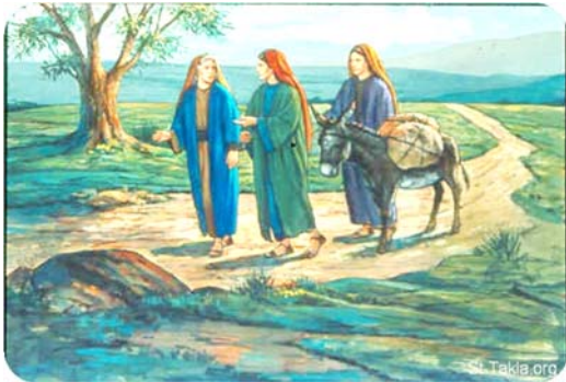
NAOMI, RUTH, AND ORPAH

sexual promiscuity was celebrated and many of those people were going down paths that they should have never gone down. It's very possible that these two girls didn't grow up with a daddy and there wasn't a dad in their home, and that's why Naomi's telling them to go back home and be with their mother.