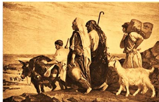
ELIMELECH AND NAOMI TRAVEL TO MOAB WITH THEIR TWO SONS

And so in the course of their time there not only did the boys play with other Moabite boys and hang out with the Moabite kids and this kind of thing, eventually the text tells us both boys end up getting married so there's some time that has elapsed. They get married and then guess what? The very thing that they went over there to avoid hits their family, the dad dies, Elimelech dies. So the very thing he set there to avoid he ends up dying and then the text tells us and goes another step further and tells us in the story that both these boys end up dying. And we ended our time together last week just talking about grief and spending time thinking through that, but what we saw as we ended were three women, very different ages, very different backgrounds—alone. And in that time that was a huge deal because they didn't have a social security system, the boys were that, and they were sort of sitting there very, very vulnerable depending on other people. And it was in that moment that word comes back from Bethlehem that God had provided food there.