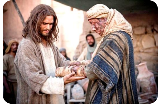
A leper comes to Jesus

First notice this, look at the text again, that the man came, he came to Jesus—now we gotta unpack this. Think about how remarkable that is. This is a person who every time he's in public is reminded that he is not worth anything. So a leper if he's going into public has to realize that he is going to be screamed at, they're gonna be running away, children are gonna be picked up by their mother, and he's gonna walk into a situation and everyone is gonna treat him like he does not deserve anything. He's gonna be treated like an outcast, like a leper, and so he knows this but yet he had decided—we know this—to go to Jesus anyway.