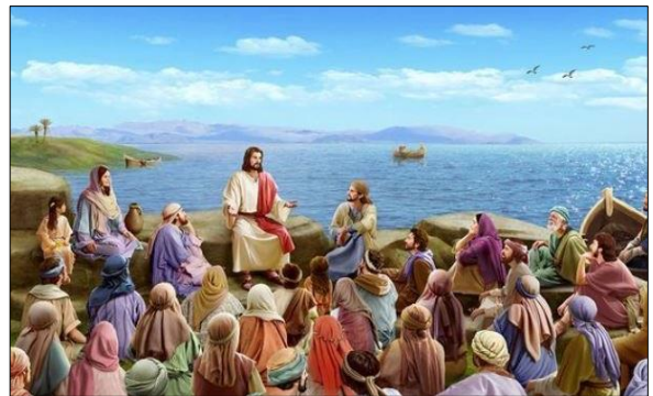
Now when Jesus saw a crowd around him... Matthew 8:18

Now these crowds aren't necessary believers. In fact, I would say that they're not. These are the curious; these are people whose attention has been piqued. Someone's come and told them and they're showing up and they're