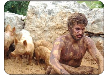
And he was longing to be fed with the pods that the pigs ate, and no one gave him anything. – Luke 15:16 (ESV)

And then Jesus tells them the story and says hey, famine hits the land, the money's used up, the kid's hungry and, you know, he's too proud to do, you know, go home to his father so he begins to feed the pigs. And he finds himself so hungry he ends up eating the pods that the pigs are eating, and it's there as he's in this pig mess he realizes in his mind, I could go home; the servants in my dad's estate are better taken care of than I am here in this pig mess. And he says you know what I'm going to do, I'm going to go home and I'm going to say Daddy, Father, I have sinned. He's not even going to ask to come back to as a son, he says I'm just going to say this, make me a servant. He's thinking to himself I've lived my life long enough to know that I've got to live in subjection to him, I can't expect anything.