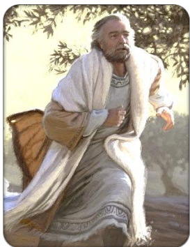
And he arose and came to his father. But while he was still a long way off, his father saw him and felt compassion, and ran and embraced him and kissed him. – Luke 15:20 (ESV)

Now here's what's not said in the story. The story does not say he takes a couple of days to clean the mess off of his feet and to get his act back together. No, it says he heads home, he heads home to his daddy. And here's the message I want you to hear here brilliantly is just that his dad is waiting – waiting for him to come home. It's a picture of the Father in Heaven waiting. And the son says father, I have sinned. I'm no longer worthy to be called a son, make me a servant. I can't do this, I need to be under your care, I need to be under your watch care, I need to be under you. I need to be under authority. The beauty of this thing is the father accepts him in—this is Jesus sharing this story so we understand—the father accepts him in and throws a party for him.