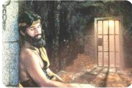
John the Baptist in prison

He's young, he's late 20's, early 30's at the latest, and he's thinking to himself, Wait a minute, this isn't how I saw all this working, This isn't how I saw this following Jesus. I mean this was the man, I mean, God had made him to be a prophet and he would speak out truth. He was the one when he saw Jesus coming towards him cried out, "Here is the Lamb of God that has come to take away the sins of the world." Okay, that's this guy. This isn't some guy that's never heard anything and has big questions. This is a guy who has been convinced and now has questions because of his circumstances where he