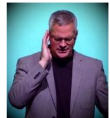
Yes. Okay. Yes. God's telling me...

Now, when you hear the word prophet I want to hear something that is a word from [HOLDS UP HIS BIBLE] God; that I know it's a word from God. You know, you see the phrase a lot in your Bible – " thus saith the Lord " 7 – I want someone that when they're speaking, they're speaking something I know that is truth from God, not some [PLACES HAND TO EAR AS IF HE'S HEARING FROM GOD] "Yes. Okay. Yes. God's telling me right now that I'm to..." Stop it! Because half the time it turns out it doesn't even turn out to be true and you're following, and then another guy says something different. And Jesus says this is a guy that comes out there and he speaks the truth. And He says hey, were you looking for a guy to come out there in soft, pretty clothing and look really nice? No. You know what, you loved this man.