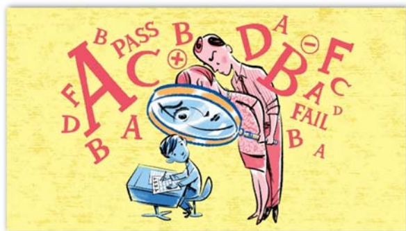
Grades – don't you dare make them an idol

want you to have good grades?" "I don't know." "Well, isn't that gonna get a good college?" "Yeah, but I don't even know what I want to do." Okay, so could idols be protection and provision?" "Yeah, yeah, oh, yeah, yeah, yeah." I said, "Okay."