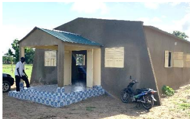
Poultok – 80 believers

Through your generous gifts in 2022 and 2023, fourteen new churches were constructed in less than 18 months in partnership with Mission Inter Senegal (MIS). These churches, and many more across Senegal, are spiritually alive! Most have a culture of prayer, commitment to the Word, evangelism and making disciples. They desire to grow in the Word so that their congregations will be strong and equipped to reach their communities for Christ.