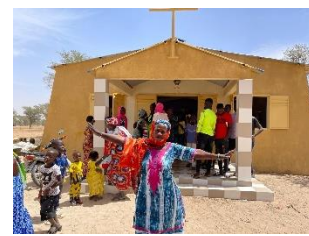
Mboyene – 100+ believers

In addition, funds were raised to support ten income-generating projects for pastors in 2023. The goal is for these pastors to be able to support themselves so that they may continue serving fulltime in the gospel ministry to which God has called them. Projects were initiated in March/April of this year and the pastors are just now beginning to reap the benefits from a variety of chicken, cattle and sheep projects.