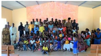
Koboran– 45 believers